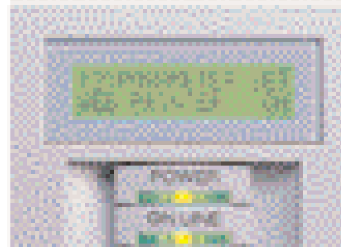
▲ User-friendly display