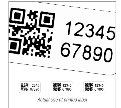
Ultra-high 600 x 1200dpi resolution using a microstep drive control system