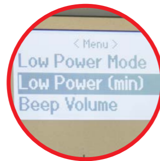
User-friendly and informative large LCD read-out

With a wealth of long-term experience and knowledge, Toshiba consistently produces thermal printing innovations for all your business-critical applications.