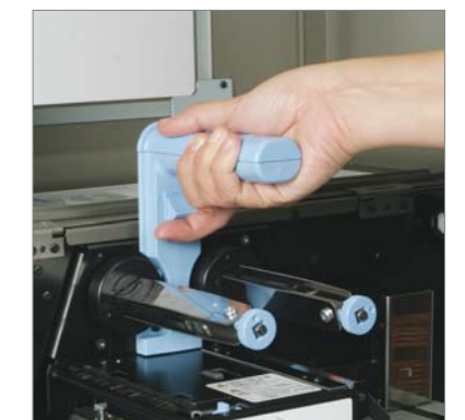
Vertical lifting head unit for easy access