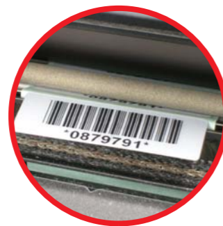
Amazing peel-off model performs on labels just 10mm high