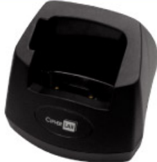
Charging & Communication Cradle